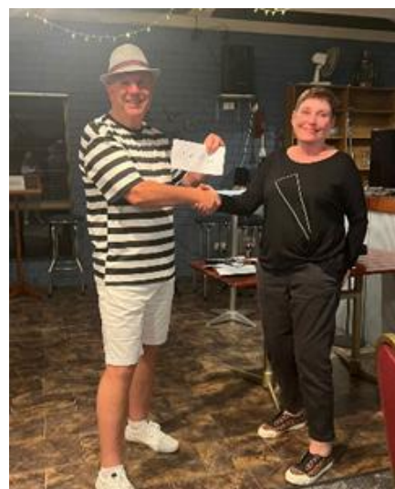
Table winner presentations. 1 st , 2 nd and 3 rd .